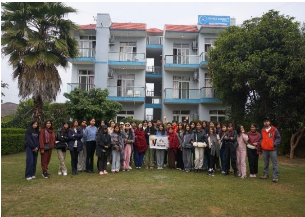
Figure 2: Jungle Corbett Castle