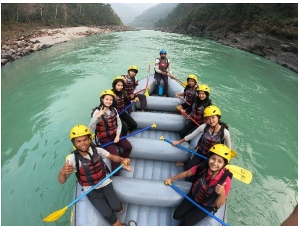
Figure 3: River Rafting at Rishikesh