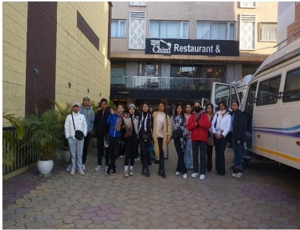
Figure 1: Dehradun