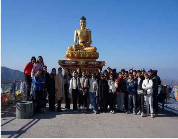
Figure 4: Dalai Hill